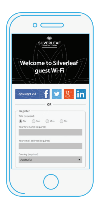
Engage with your guests using a branded Wi-Fi portal